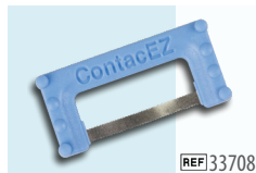
Blue Narrow Strip Subgingival Cutter Double-Serrated • No Diamond