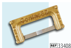
Gold Narrow Strip Subgingival Trimmer Single-Sided • Med-Coarse Diamond Central Gateway