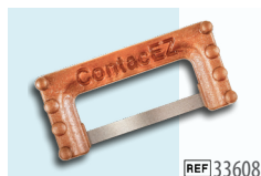
Copper Narrow Strip Subgingival Polisher Single-Sided • Fine Diamond