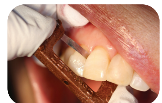
Copper Narrow Strip being used in the subgingival area